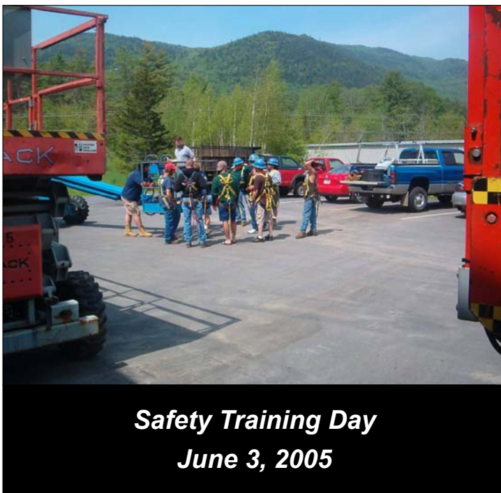
Safety Training Day June 3, 2005

On June 3rd we held a company wide Safety Training Day. We had scheduled a couple of agencies to come in and speak with all of us: